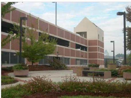
The new 500 vehicle parking deck was completed in August of 2006.

The cost of construction projects continued to exert significant influence on the University's financial statements for 2007 and will continue to do so through 2008. Since the passage in