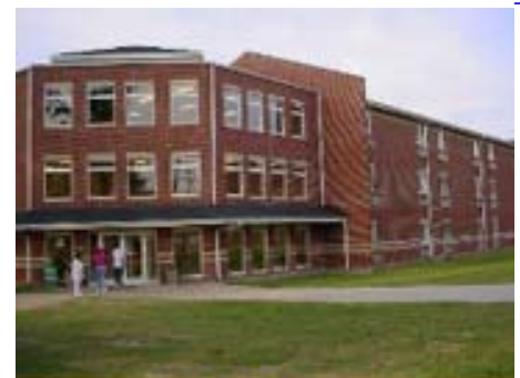
Aggie Suites E