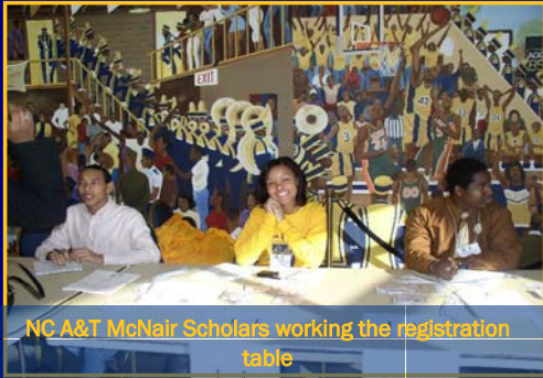
NC A&T McNair Scholars working the registration table