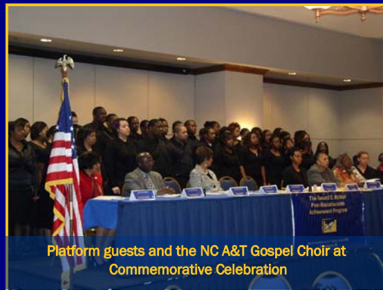
Platform guests and the NC A&T Gospel Choir at Commemorative Celebration