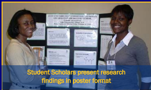
Student Scholars present research findings in poster format