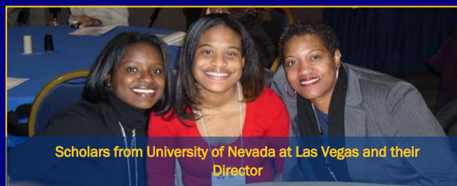
Scholars from University of Nevada at Las Vegas and their Director