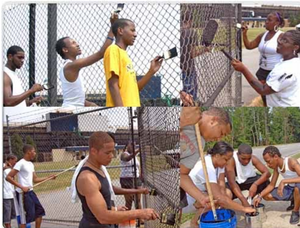
Students painted the Aggie Stadium fence as a Civic and Service Education project sponsored by the Office of Student Development in the Division of Student Affairs.