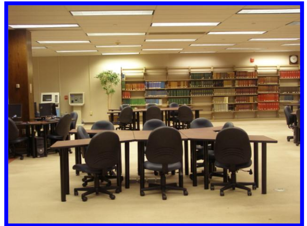
Reference Area in Transition