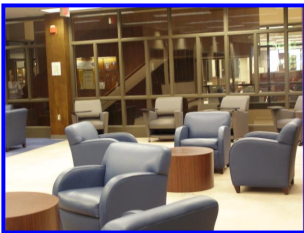
Second Floor Reading Area

The library will organize, present, and deliver client-centered information services that are easily accessible and can be utilized independently.